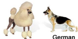
Poodle German Shepherd