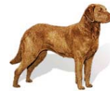
Chesapeake Bay Retriever